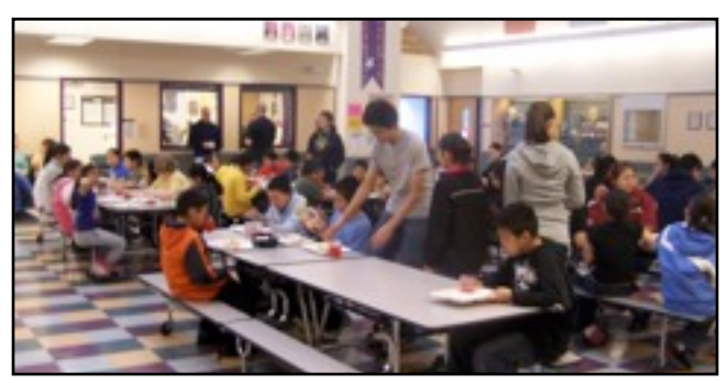
Breakfast of Champions. Wonderful breakfasts were prepared by the cooks for the students.

We appreciate the leadership demonstrated by several students groups who led fun activities at the Pep Rally.