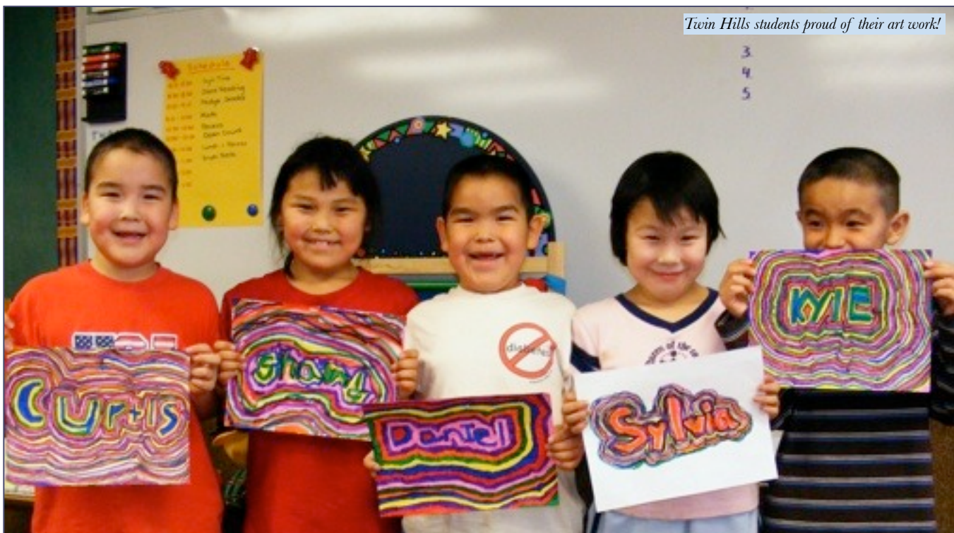
Twin Hills students proud of their art work!

Several teachers traveled to Dillingham on the weekend of March 14th to complete various Praxis II assessments. These Praxis II assessments are one of several ways in which teachers can become highly qualified (as required by the No Child Left Behind Act) in the content areas that are taught by those teachers. Many more teachers are slated to take Praxis II examinations in April.