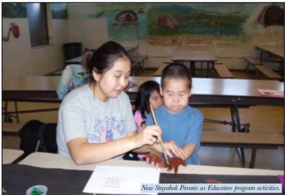
New Stuyahok Parents as Educators program activities.

The special ed teachers at the sites will be working with the PAT educators to complete the Child Find screening. All of the screening completed by March 6th. We've already seen the need for further testing for a number of the students. The staff will be reviewing the results and sending a letter to parents sharing that information. Parents of those students with whom we need to do additional testing will be notified and consent will be requested. Parents have the right to refuse further testing, but we hope they will consider the benefits of working as soon as possible with those children who have potential developmental delays.