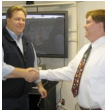
Clarks Point School makes AYP - 2008-2009