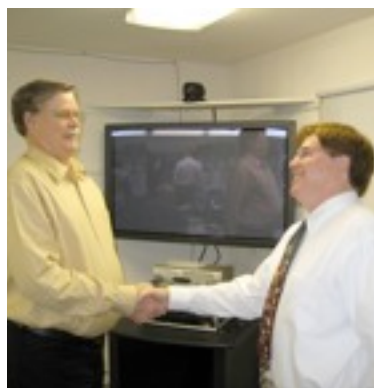
Togiak School makes AYP - 2008-2009