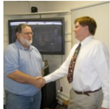
'Chief' Ivan Blunka School makes AYP - 2008-2009