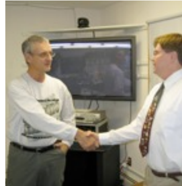
Manokotak 'Nunaniq' School makes AYP - 2008-2009