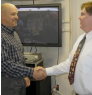
Aleknagik School makes AYP - 2008-2009

Visualization is forming vivid pictures in your mind. It is also seeing things happen before they actually do. Through, visualization, your imagination can show you what you want to accomplish. Once these creative thoughts are established, you can then transform them into reality.