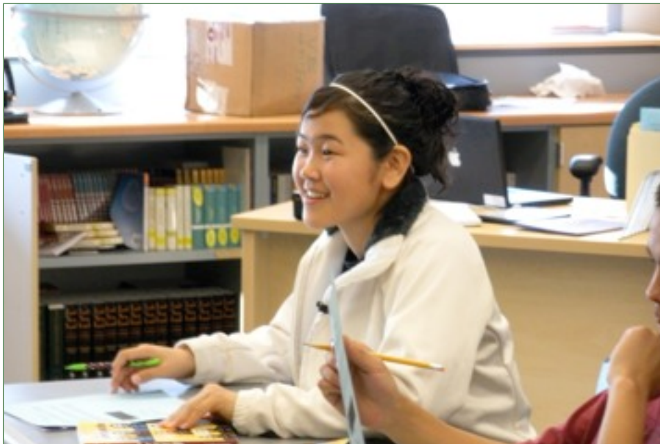
Manokotak high school student in English class.

Schools are registering for the K-8 District Spelling Bee that will be held in February 2009. The last day to register was October 15th.