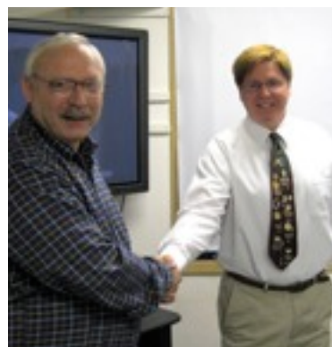
Twin Hills School makes AYP - 2008-2009