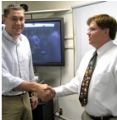
Koliganek School makes AYP - 2008-2009