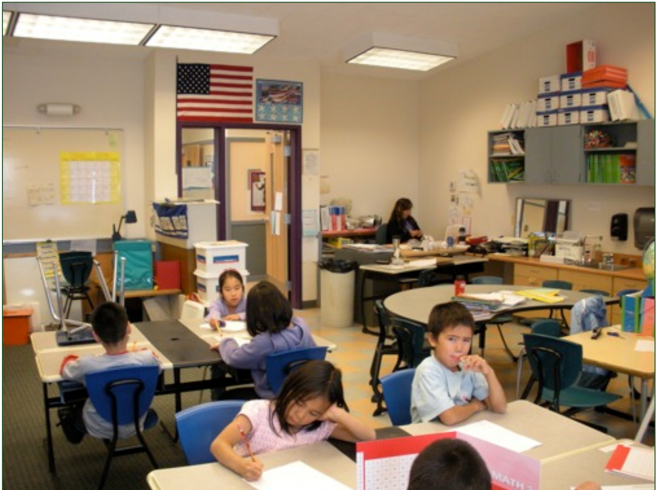
Manokotak 'Nunaniq' elementary students hard at work...

The student council has had several fund raising activities such as money walks, cake-walks, and Eskimo bingo. The student council began a new activity this month with TGIF Movie Night. The student council has already begun decorating the gym for the Halloween Carnival.