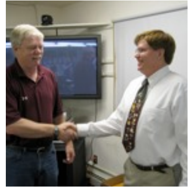
William 'Sonny' Nelson School makes AYP - 2008-2009