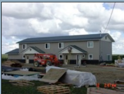
Construction is nearing the final stages as crews finish the outside of the building and begin finish work inside!