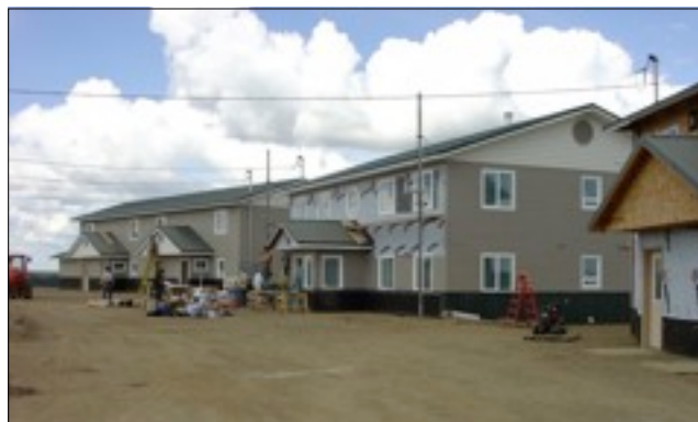
New teacher housing units in New Stuyahok.

We are working on a Koliganek School replacement. We are also working on heating system replacements in Aleknagik, Clarks Point and Ekwok. Teacher housing is being applied for in Manokotak (8 units) and Togiak (4 units).