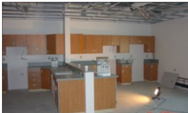
Cabinets going into classrooms in New Stuyahok.