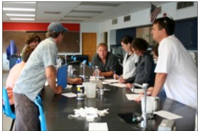
Staff collaboration meetings at the fall inservice.

curing from August 18th through August 20th. Migrant education recruiting will occur during the months of August through October in order for the results to be submitted to the state by November 15th.