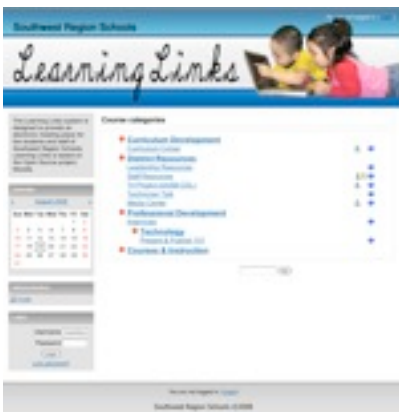
new Learning Links web site

Our web site is being updated and improved. In particular, we have added a number of sections designed to improve communication across the district. A new Leadership Resources area has been added to give site administrators electronic access to all school board policies and district regulations and forms. Areas are also under development to allow teachers electronic access to curriculum materials and discussion groups designed to enhance instruction.