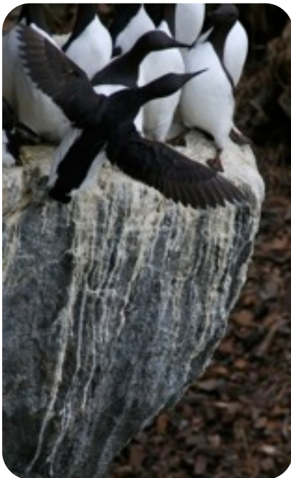
Seabirds along the coast near Togiak (above)