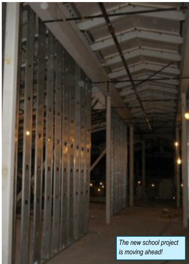
The new school project is moving ahead!