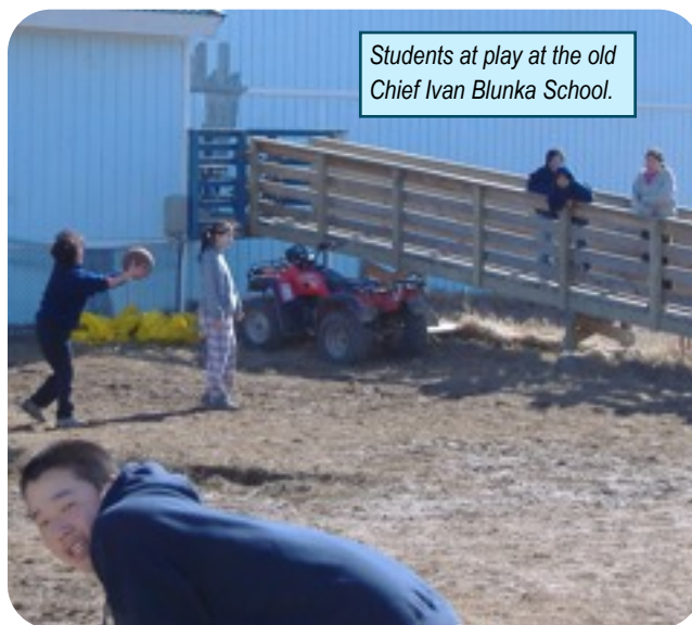
Students at play at the old Chief Ivan Blunka School.

We will be starting the installation as soon as materials are on site.