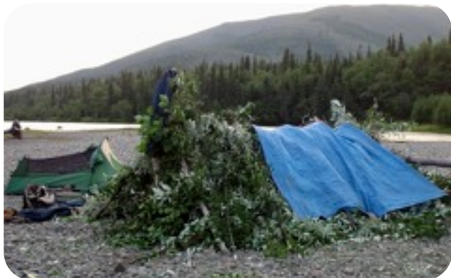
Camp... (above) --Natalia Bond