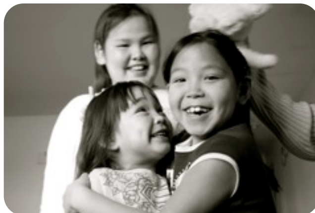
Students at play in Togiak (above)