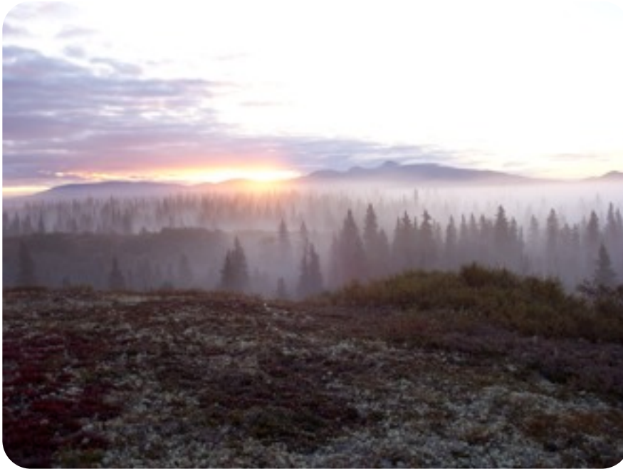
Foggy morning at Table Mountain. (above)