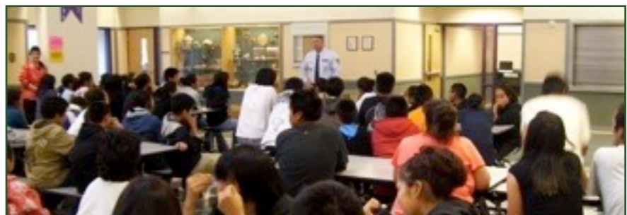
Manokotak listen to a presentation by an Air Force Recruiter. Recruiters visited several high schools over the past few weeks to talk to students about career opportunities.