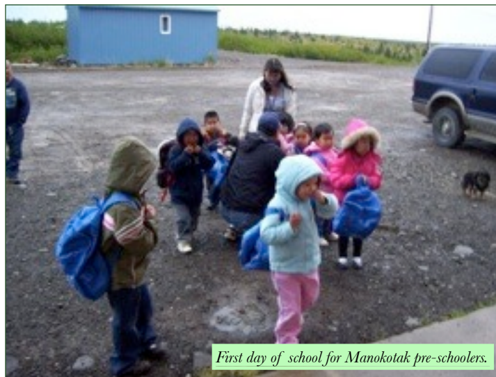
First day of school for Manokotak pre-schoolers.

The Maintenance Department really appreciates the patience and willingness to help that all of our Site Administrators have shown this year.