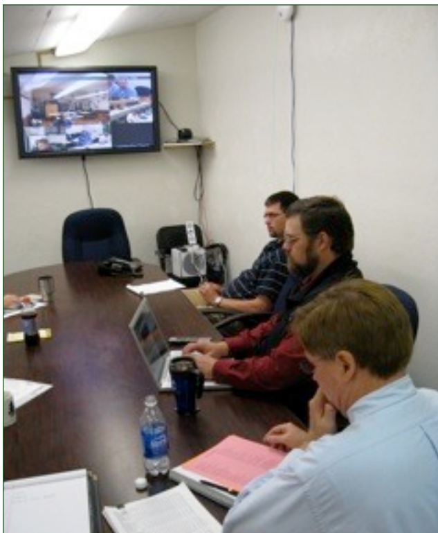
Morning Collaborative Leadership Team meeting with principals via distance delivery.

As a district, we are working on our curriculum this year. You will be hearing more about this throughout the year in department reports.