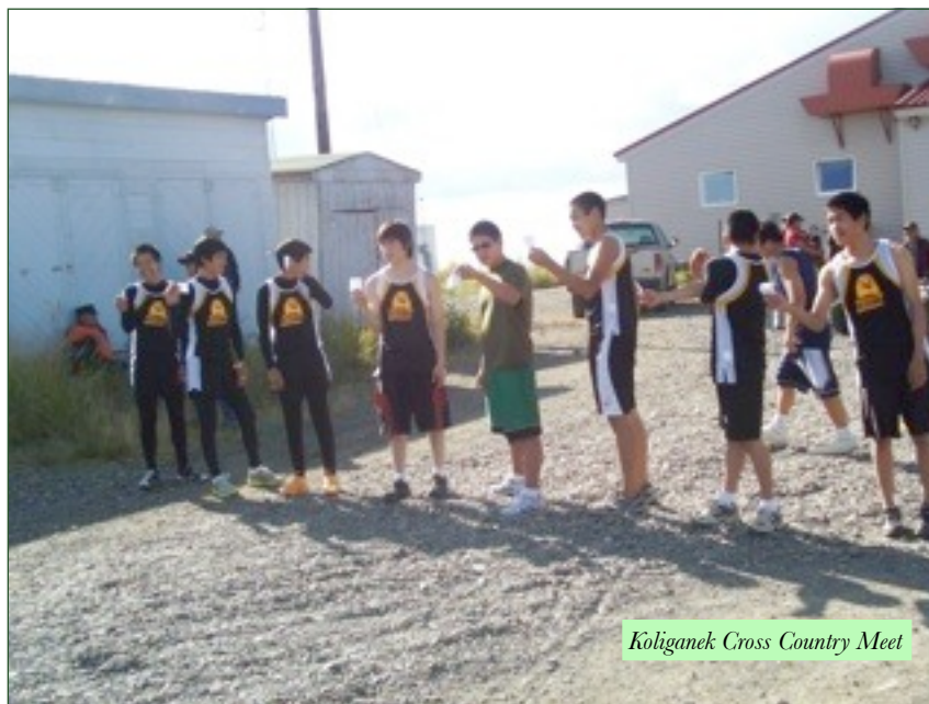
Koliganek Cross Country Meet

The district improvement plan for this school year is currently being developed. The district report card and school report cards are nearly completed and we are just waiting for some data from the state. Limited English Proficient identification notifications and exit letters were sent to parents. Other projects include determining the highly qualified status of both the certified staff and instructional aides, then creating plans to assist staff reach the required highly qualified status.